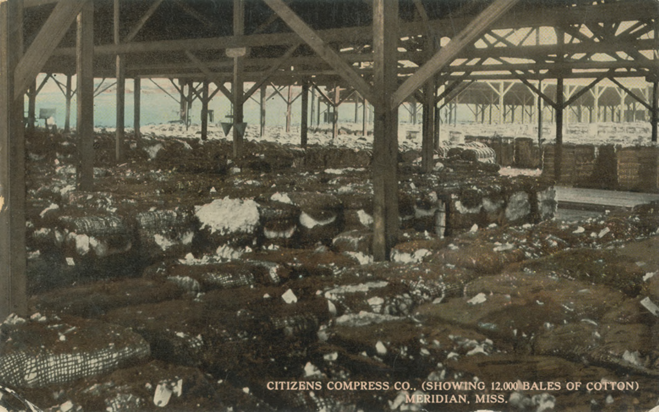
CITIZENS COMPRESS CO., (SHOWING 12,000 BALES OF COTTON) MERIDIAN, MISS.