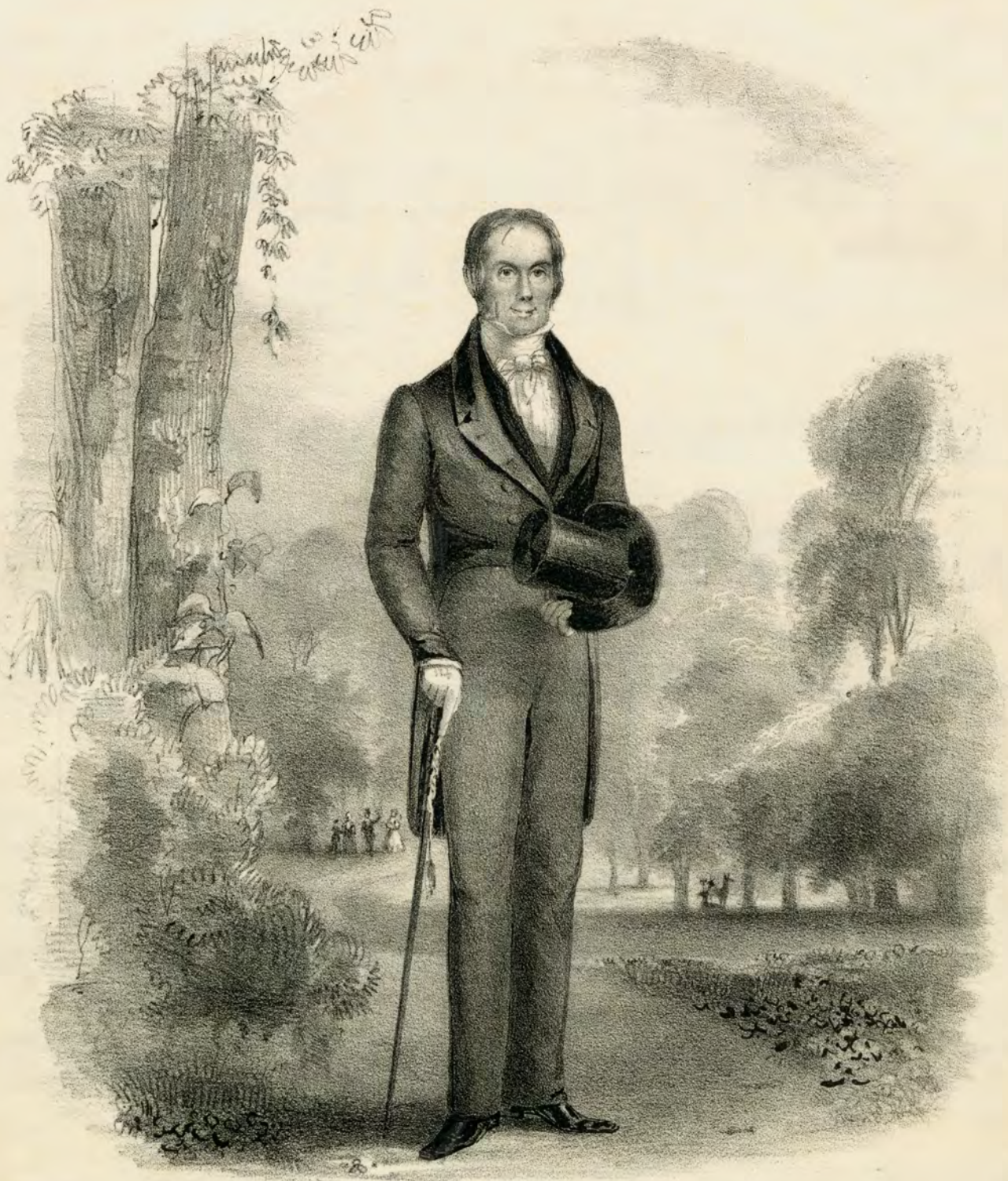
Thayer & Co. Lithog.