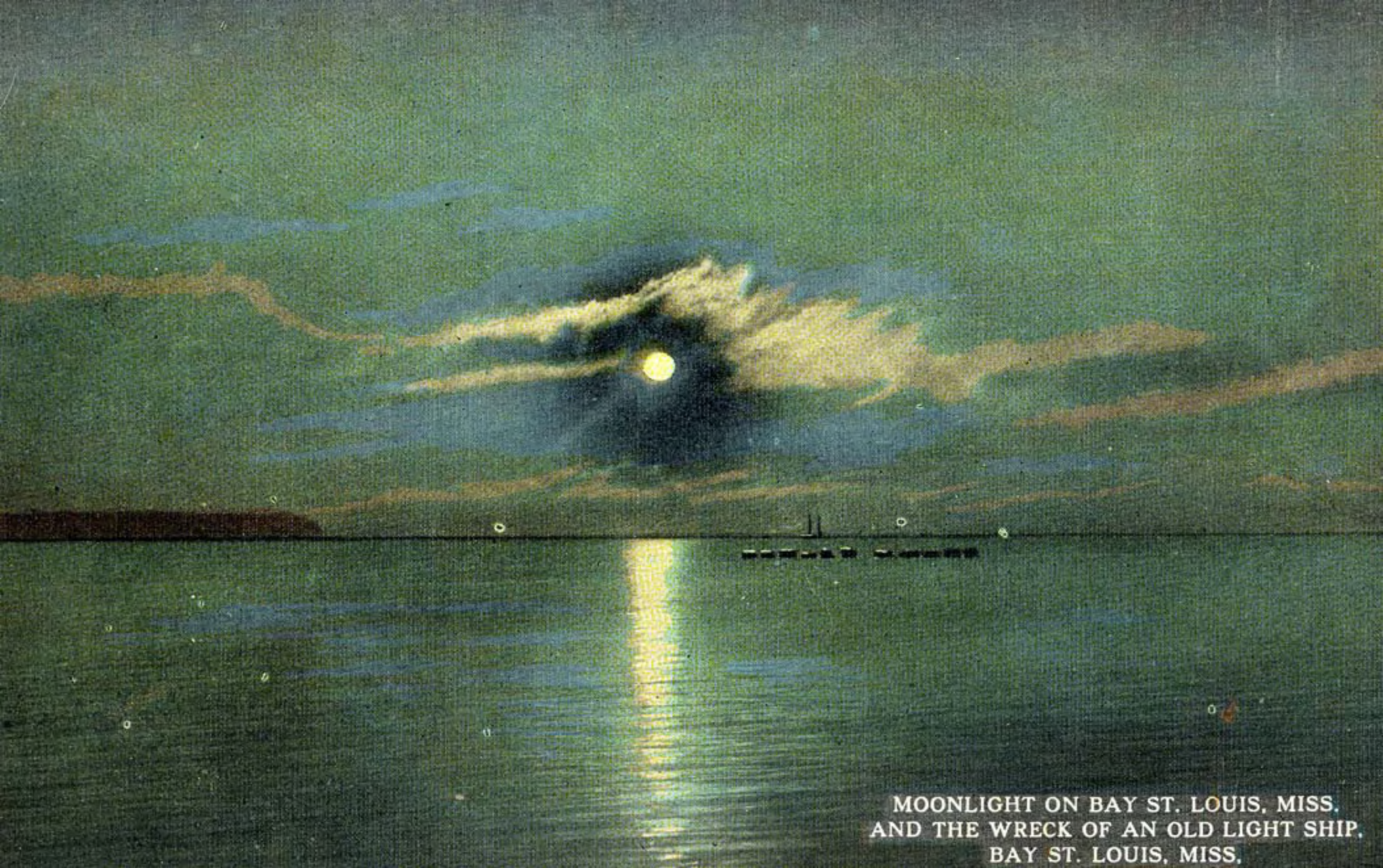
MOONLIGHT ON BAY ST. LOUIS, MISS. AND THE WRECK OF AN OLD LIGHT SHIP, BAY ST. LOUIS, MISS.