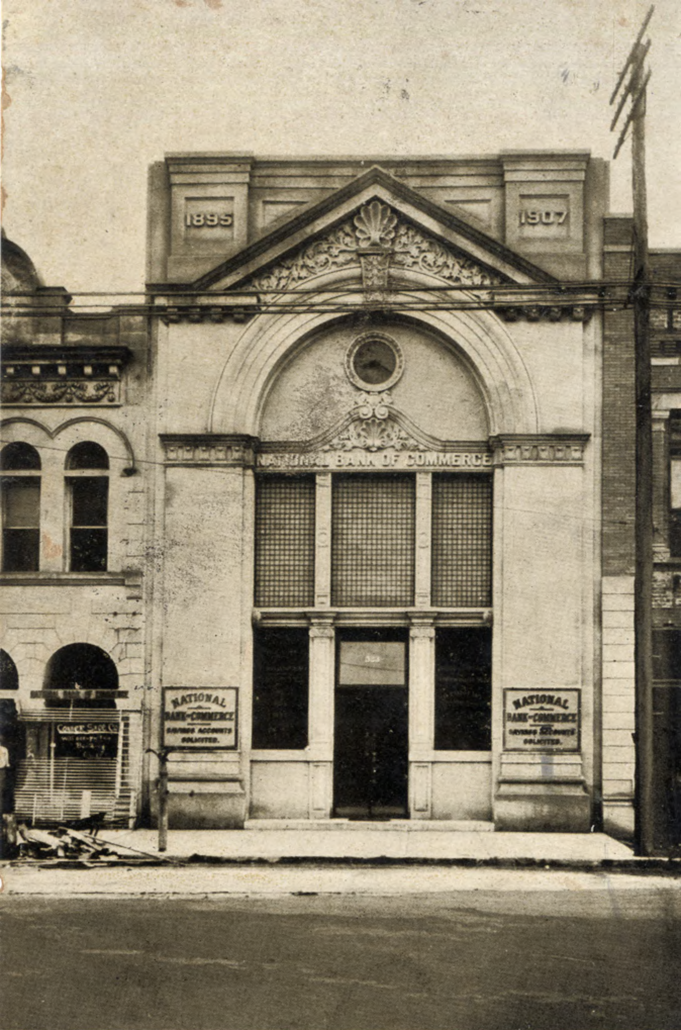
5710 National Bank of Commerce, Main St., Hattiesburg, Miss.