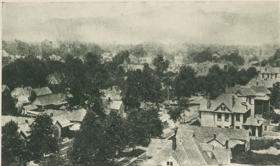
RESIDENCE SECTION FROM WATER TANK, CLARKSDALE, MISS.