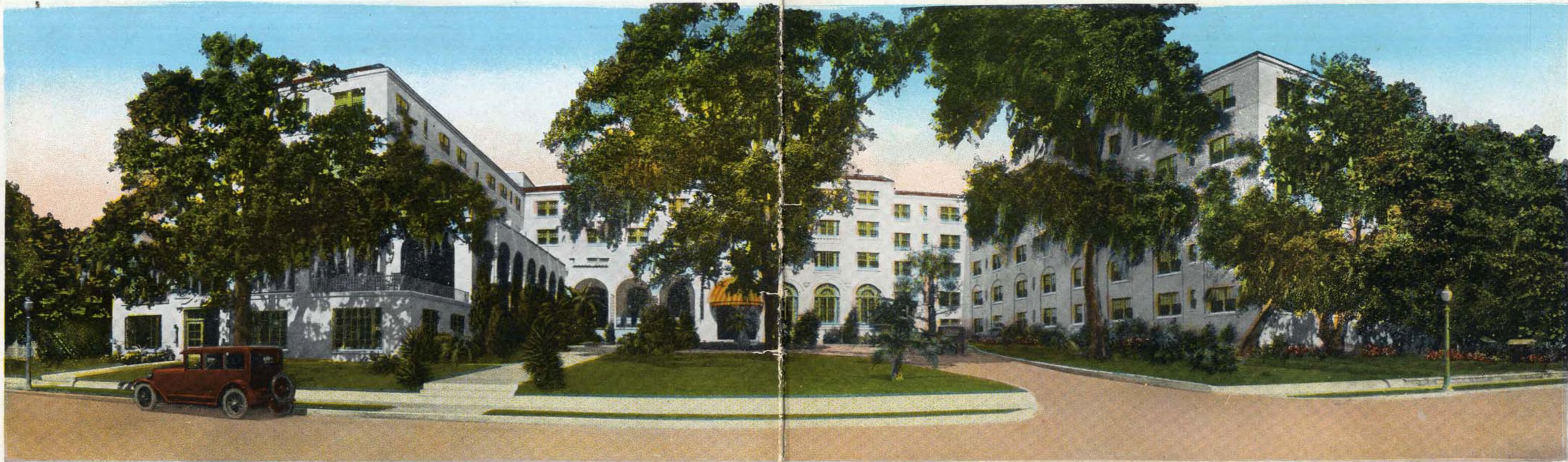
BUENA VISTA HOTEL, BILOXI, MISS.