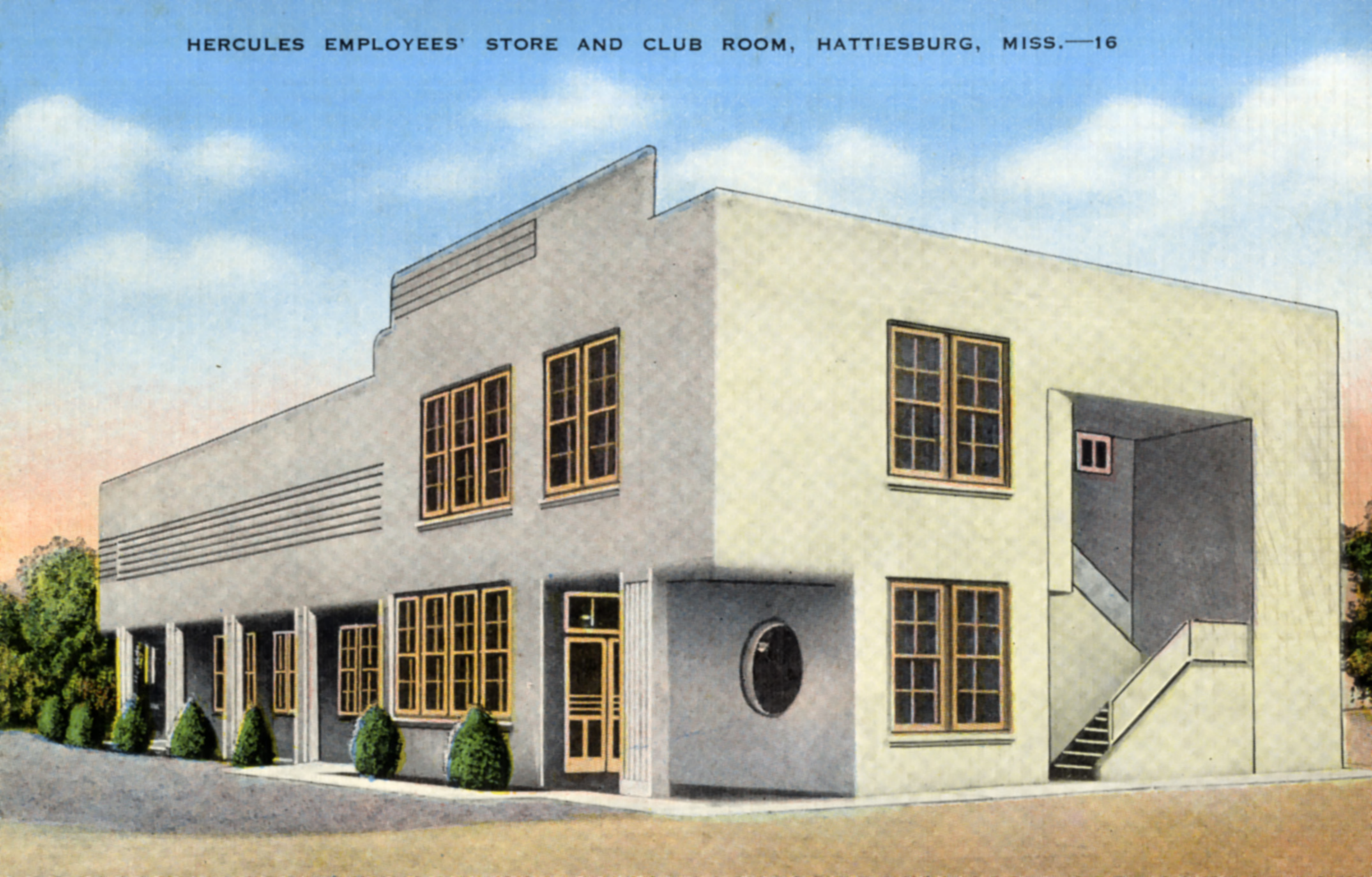
HERCULES EMPLOYEES' STORE AND CLUB ROOM, HATTIESBURG, MISS.—16