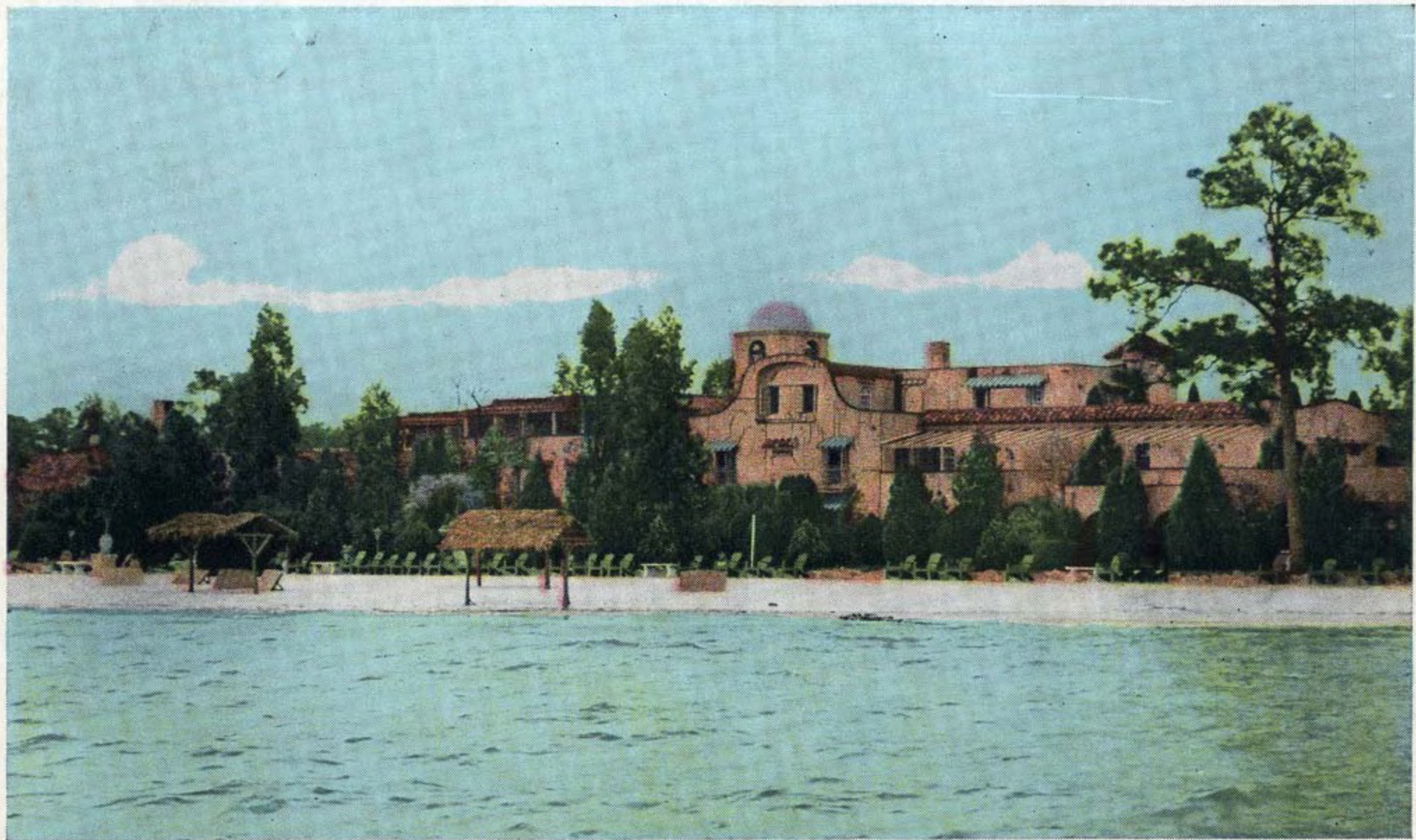
PRIVATE SAND BEACH IN FRONT OF INN-BY-THE-SEA, PASS CHRISTIAN, MISS.