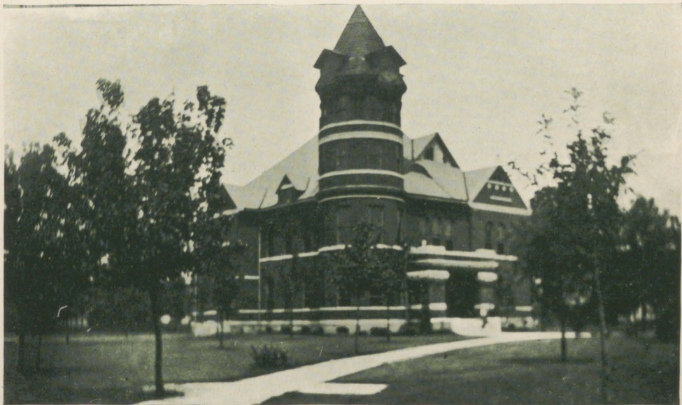
COURT HOUSE, CLARKSDALE, MISS.