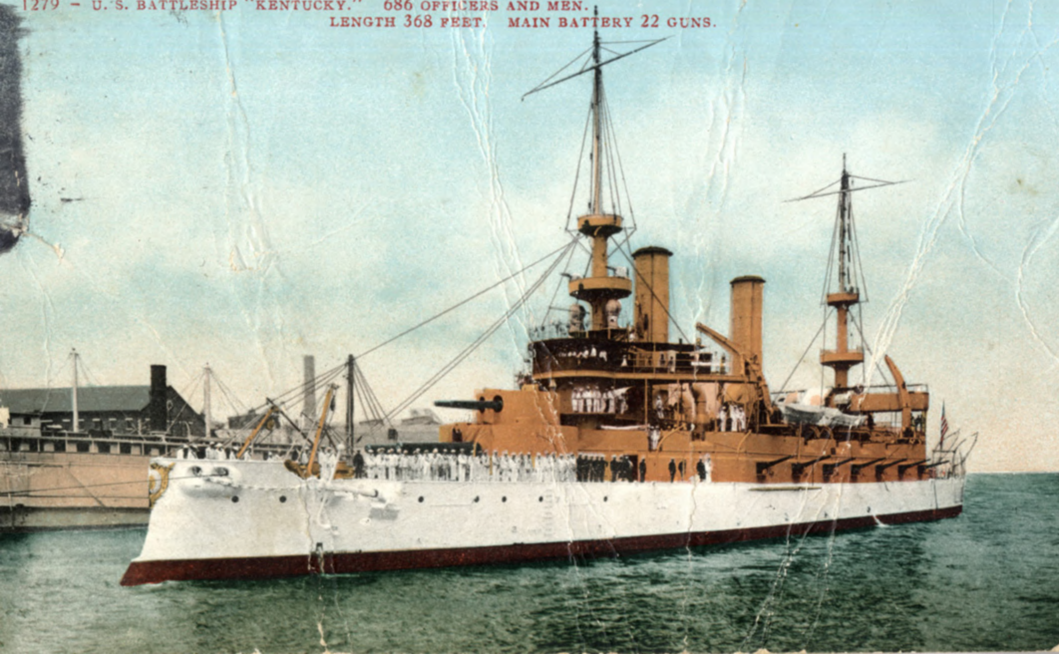
1279 - U. S. BATTLESHIP "KENTUCKY." 686 OFFICERS AND MEN. LENGTH 368 FEET. MAIN BATTERY 22 GUNS.