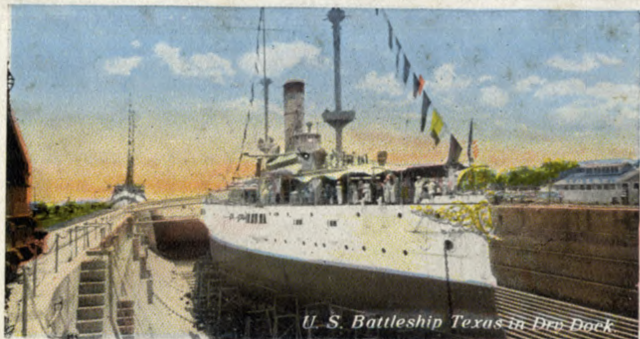
U. S. Battleship Texas in Dry Dock