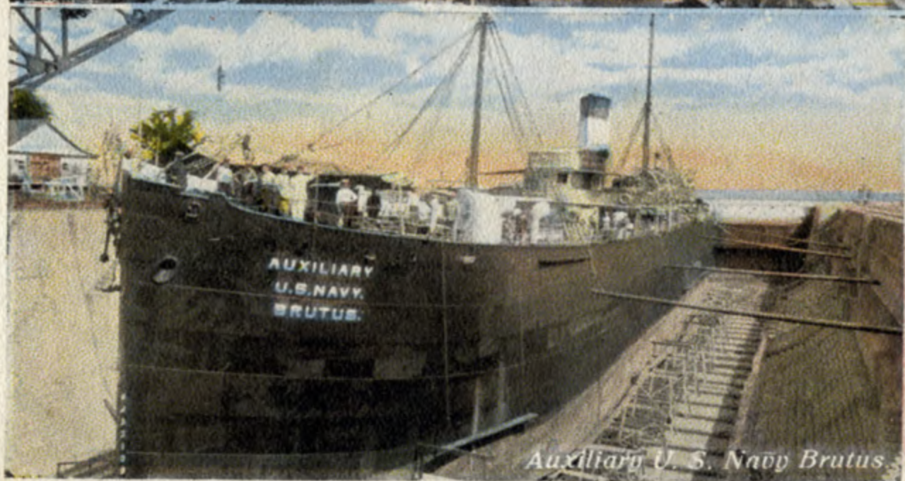
Auxiliary U. S. Navy Brutus

SCENE AT THE DRY DOCK NAVY YARD, CHARLESTON, S. C.