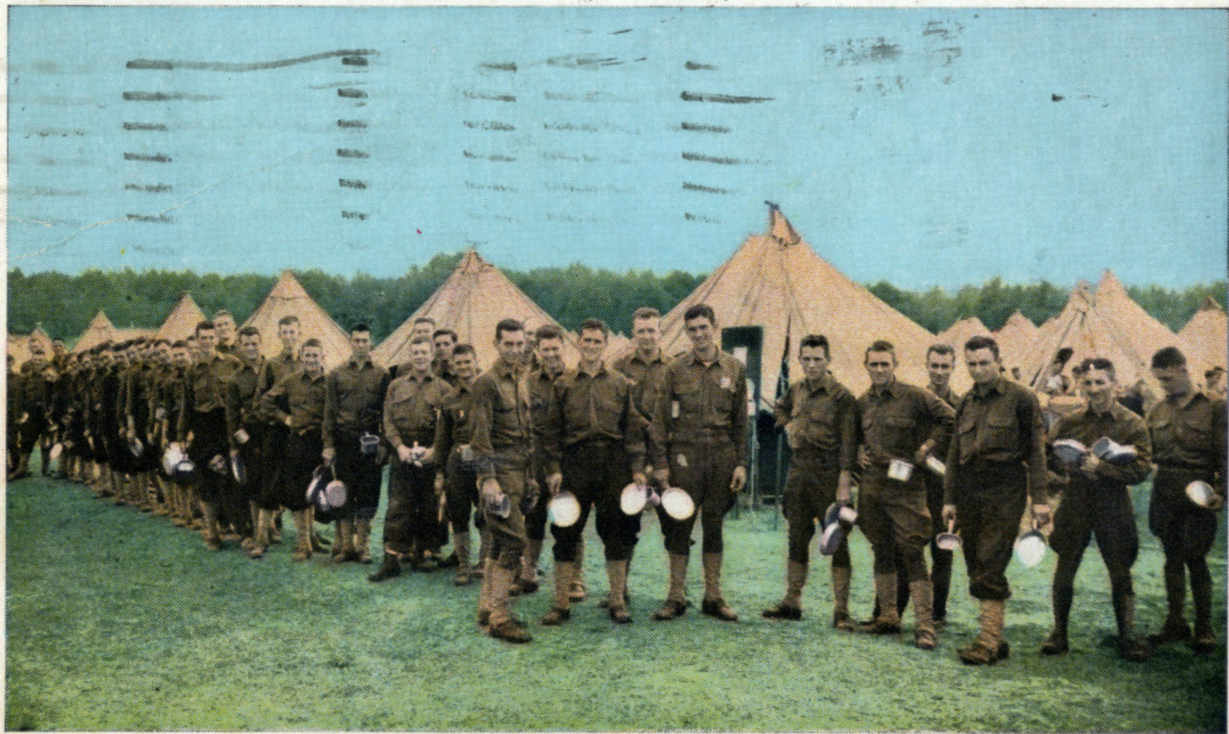
CHOW LINE AT NOON---CAMP SHELBY, MISSISSIPPI