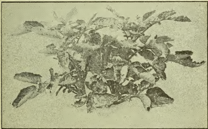
Fig. 3. Potato plant infected with leaf-roll.

Leaf-roll. Plants infected with this disease are usually badly dwarfed and show a very severe upward rolling of the leaflets (Fig. 3). The leaves are stiffer and thicker to the touch than normal ones which give the plants a very rigid appearance. They