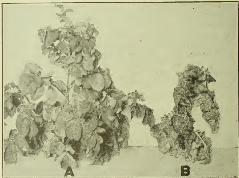
Fig. 2. A, Healthy plant; B, plant infected with rugose mosaic.

in Mississippi, namely mild mosaic and rugose mosaic. The leaves of plants which are affected with mild mosaic are mottled with yellowish-green or light green spots which usually shade off gradually into the adjacent normal, green tissues. These spots vary greatly in size, shape, location, and abundance. They are seldom more than one-fourth of an inch across although they may follow a vein in the leaf for a much longer distance. They may be circular in outline but are usually more irregular and more or less elongated. At high temperatures, these symptoms tend to disappear and it is then difficult or impossible to dis-