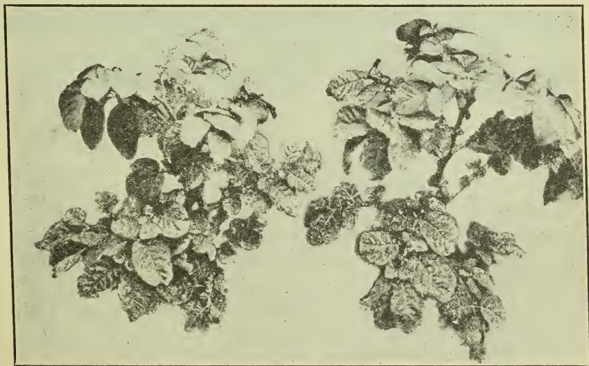
Fig. 1. Plants infected with mosaic showing the typical crinkling or puckering of the lower leaves.

Mosaic. There are apparently several types of mosaic affecting the Irish potato. Two of these types are very common