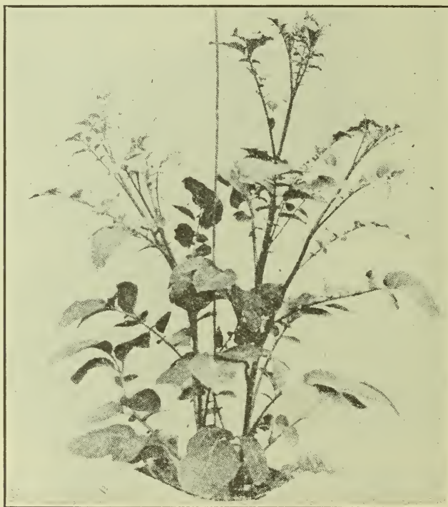
Fig. 4. Potato plant infected with spindle-tuber. (After Goss)

The rolling of potato leaves due to wilt diseases, Rhizoctonia , black-leg, excessive moisture in the soil, etc., should not be confused with leaf-roll. The rigidity or stiffness of plants infected with leaf-roll distinguishes them from plants with limp, wilted leaves which are characteristic of wilt diseases, black-leg, and the