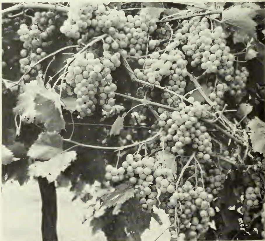
Figure 3. Heavy fruiting of a six-year-old 'MissBlanc' grapevine in the research vineyard of the Truck Crops Branch Station at Crystal Springs, Mississippi on August 7, 1979.