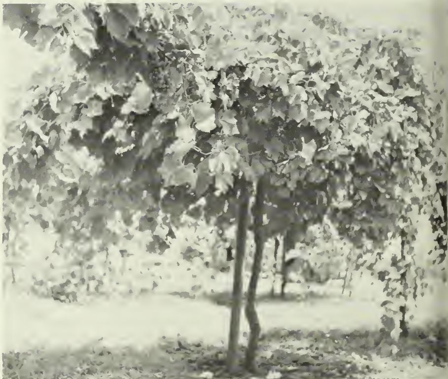
Figure 2. A vigorous, eight-year-old vine of 'MissBlanc' bunch grapes at the Truck Crops Branch Station at Crystal Springs in August 1981. This vine produced 60 pounds of grapes in 1981.

MissBlanc has perfect flowers and should be fully self-fertile, but has not been grown under isolated conditions by MAFES personnel. The berries are white to green in color. Clusters are shown on the front and in Figure 3.