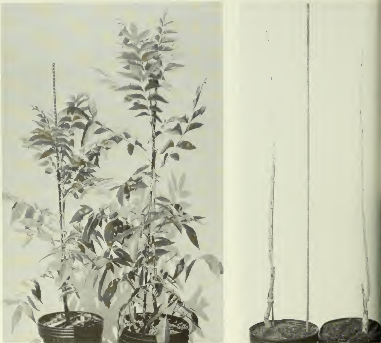
'Cape Fear' pecan trees with two-year-old roots and one-year-old scions in October and February (diameter of containers is 10 inches).

Mention of a trademark or proprietary product does not constitute a guarantee or warranty of the product by the Mississippi Agricultural and Forestry Experiment Station and does not imply its approval to the exclusion of other products that also may be suitable.