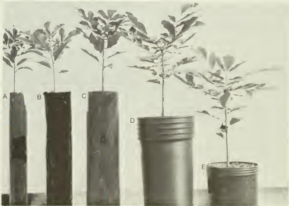
Figure 3. Average seedlings after one growing season in the nursery-container experiment. Containers are A, 3 x 24 inch; B, 4 x 24 inch; C, 6 x 24 inch; D, 10 x 20 inch; E, 10 x 10 inch.

We made a study of seedling pecan trees grown in containers of various shapes and sizes. The five container types selected for the study are illustrated in Figure 3 and described in Table 2.