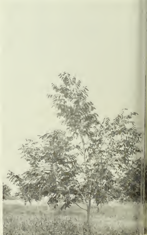
Figure 5. Pecan trees five years after transplanting to the orchard. Trees were grown in 2-gallon containers for one year before transplanting. Tree on left irrigated and tree on right was not.