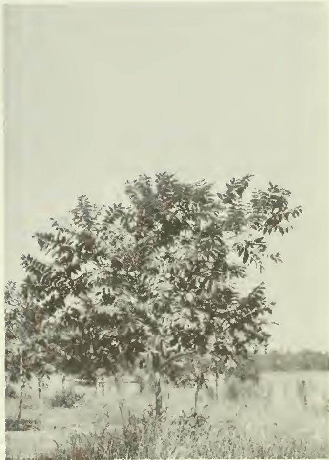
Figure 6. Pecan seedling trees after five years in the orchard. Tree on left was grown from a barerooted nursery tree with a 30-inch taproot. Tree on right was grown from a nut planted when the barerooted tree was set in the orchard.