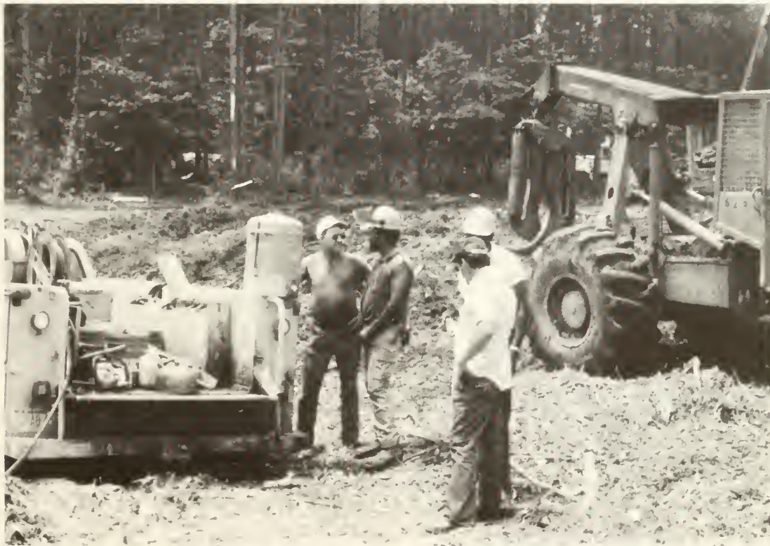
Logging crews are more than an aggregation of individuals; they are small social groups as well.

Although economists have treated the timber harvesting crew as the basic unit of production, it has been almost totally ignored as a unit of analysis by other harvesting researchers. In perhaps the only direct reference to a crew-level