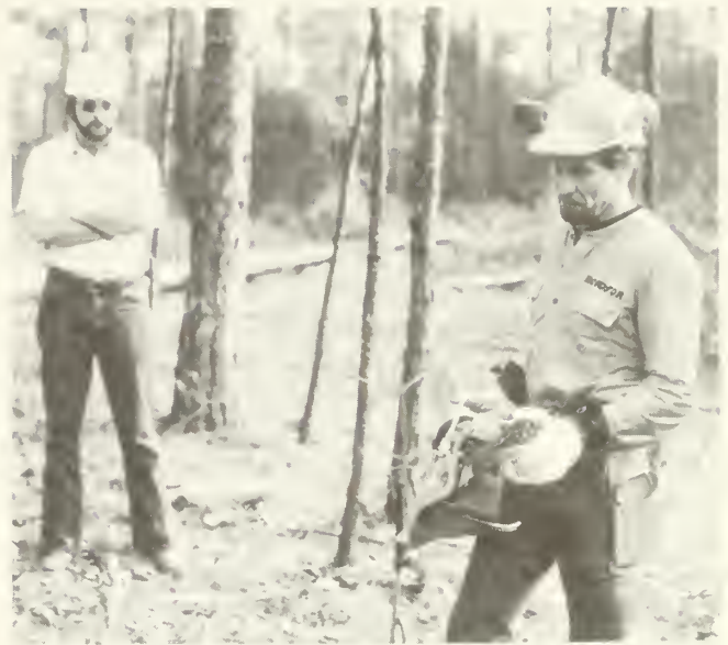
Selection, motivation, and training of loggers has received most of the attention by harvesting researchers over their past several years.