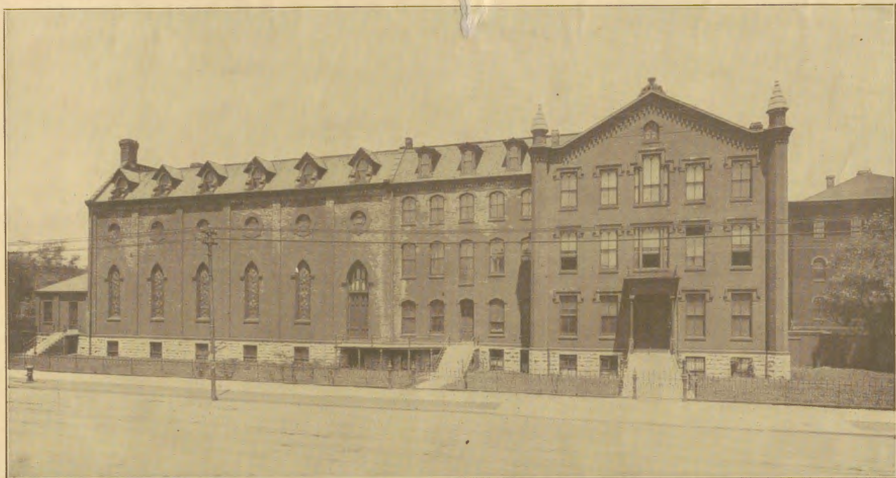
THE CHICAGO HEBREW INSTITUTE