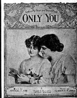
Waltz Song Hit