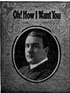
Great Waltz Ballad