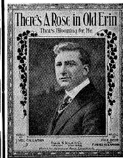
Popular Irish Ballad

Complete Copies on Sale Wherever Music Is Sold!